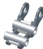
TIPO B - A RULLI

CATENA PRODOTTA DA AZIENDA CERTIFICATA ISO 9001/2000 - ISO 14001 E API 7F CHAIN PRODUCED BY ISO 9001/2000 - ISO 14001 AND API 7F CERTIFIED COMPANY